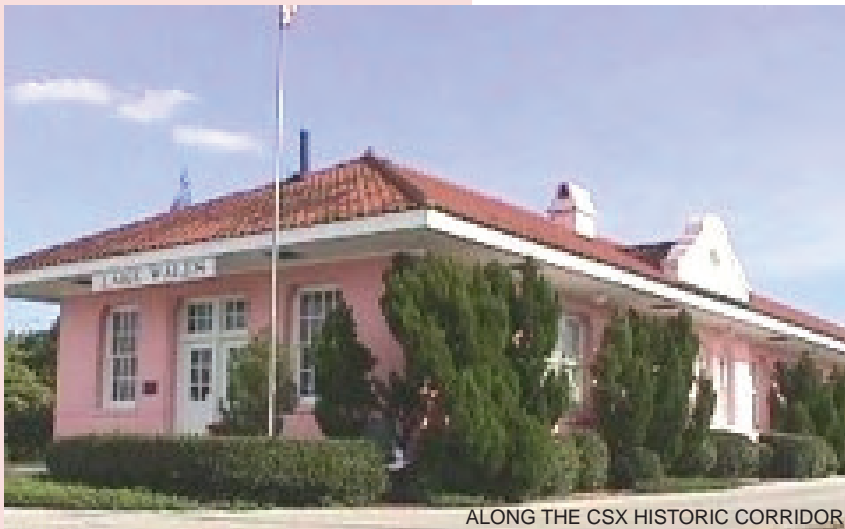
ALONG THE CSX HISTORIC CORRIDOR

From Bartow follow US98 about 16 miles to S. Wetmore Ave. and turn left. Follow S. Wetmore about .2 miles to W. Johnson Ave and turn right. Follow W. Johnson about .4 miles to SR17 (Scenic Hwy) and turn right. The Depot and parking will be